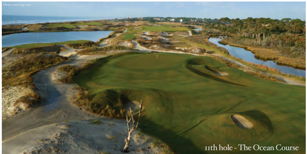
11th hole - The Ocean Course