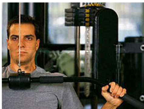
Forget the fallacies: Strength training can help improve your golf game.

Various aspects of golf training have expanded rapidly, but one area of development that has caught on somewhat slowly is golf-specific strength training. This specific need had not been addressed until very recently. The truth is that the days of simply practicing and playing to make yourself a stronger and better golfer are from a bygone era. Ultimately, golf skills are the most important aspect of golf, but improving your swing performance will only get you so far. Regardless of your goals, a strength-training program is beneficial in the development of your golf swing and golf game.