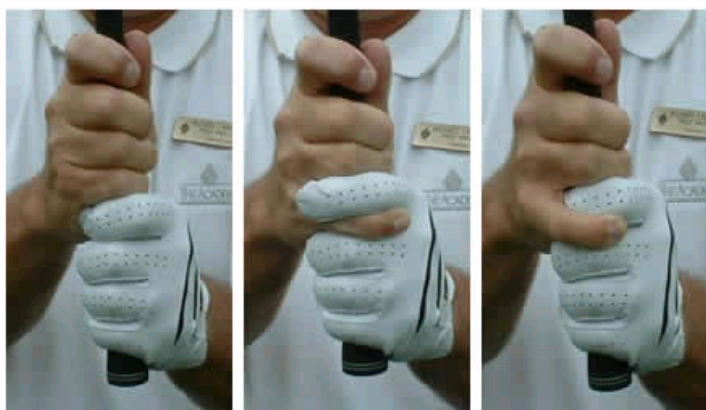
Ten Finger Grip